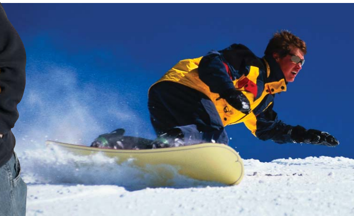
▲ Off-campus outdoor activities abound during all seasons.