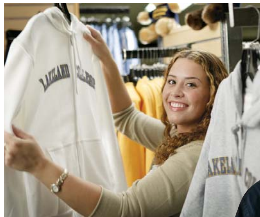
▲ There's a place for everyone to pursue special interests and expand personal skills in campus clubs and activities.