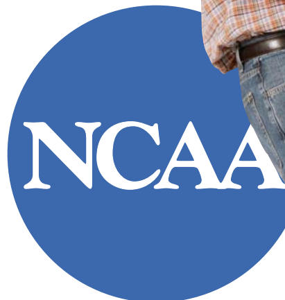
▲ Lakeland's 15 NCAA Division III athletic teams for men and women make their mark at the conference, regional and national level.